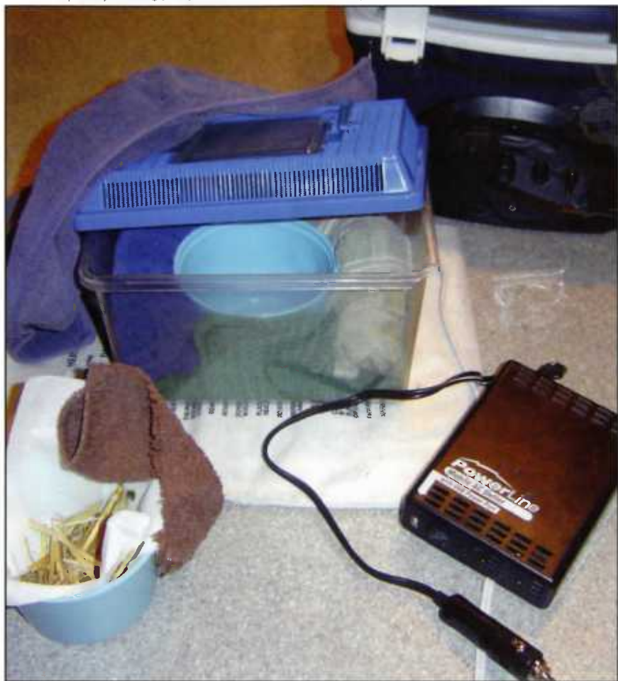
Mobile Set-Up Ready – heating pad, power inverter, brooder, chick's cup, and ice chest.

formula is 75% Kaytee Exact Hand-feeding formula to 25% fruit Gerber's strained baby food mixed with water to a pancake batter consistency. When it is feeding time, I fill the cup with warm (not hot) water, draw up the formula in the syringe, and place the syringe in the water to heat the formula. If no hot water is available, I heat the syringe full of formula by placing it on the heating pad for a couple of minutes. I always test the temperature of the formula on my wrist before feeding to make sure