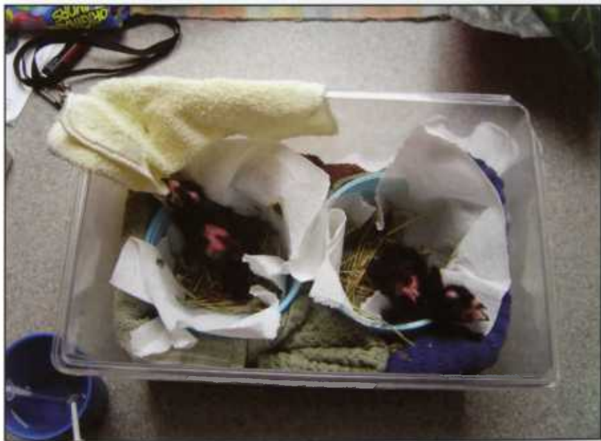
Two turaco chicks in brooder container.

At work or wherever I go, I have to plug in my heating pad, but I haven't found that to be too difficult. I get good at looking for power outlets! For the car, I bought a Mobile AC Outlet (DC to AC inverter = 200 watts continuous) that plugs into the lighter socket in the car's