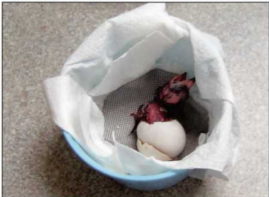
Newly hatched chick in his cup.

At work or wherever I go, I have to plug in my heating pad, but I haven't found that to be too difficult. I get good at looking for power outlets! For the car, I bought a Mobile AC Outlet (DC to AC Inverter - 200 watts continuous) that plugs into the lighter socket in the car's