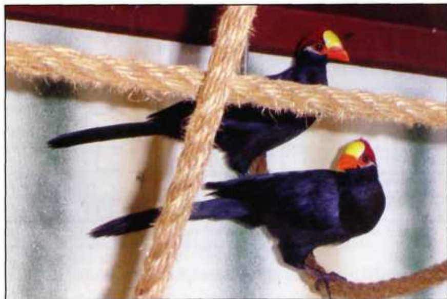
Violet turacos.