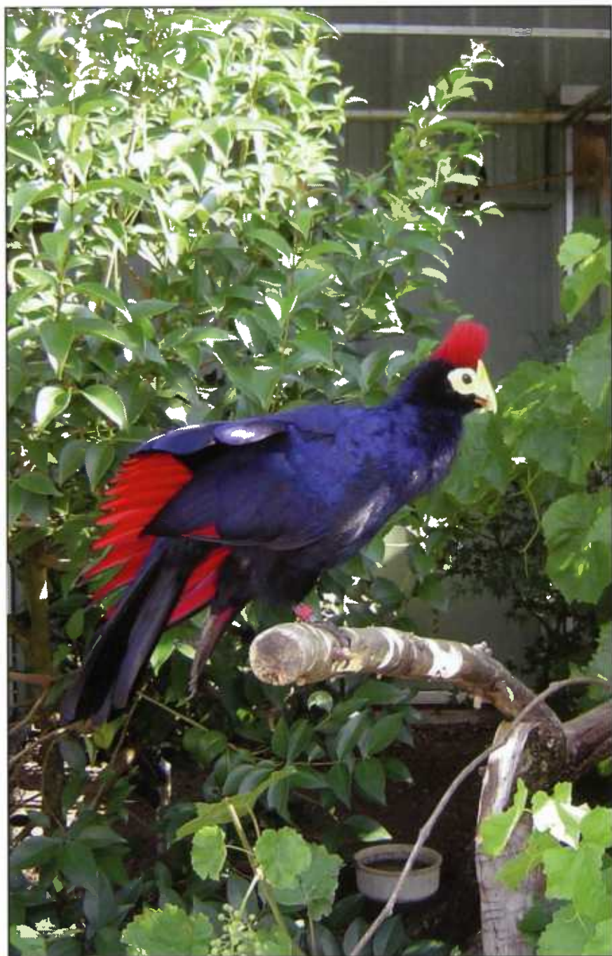
Lady Ross Turaco stretching.