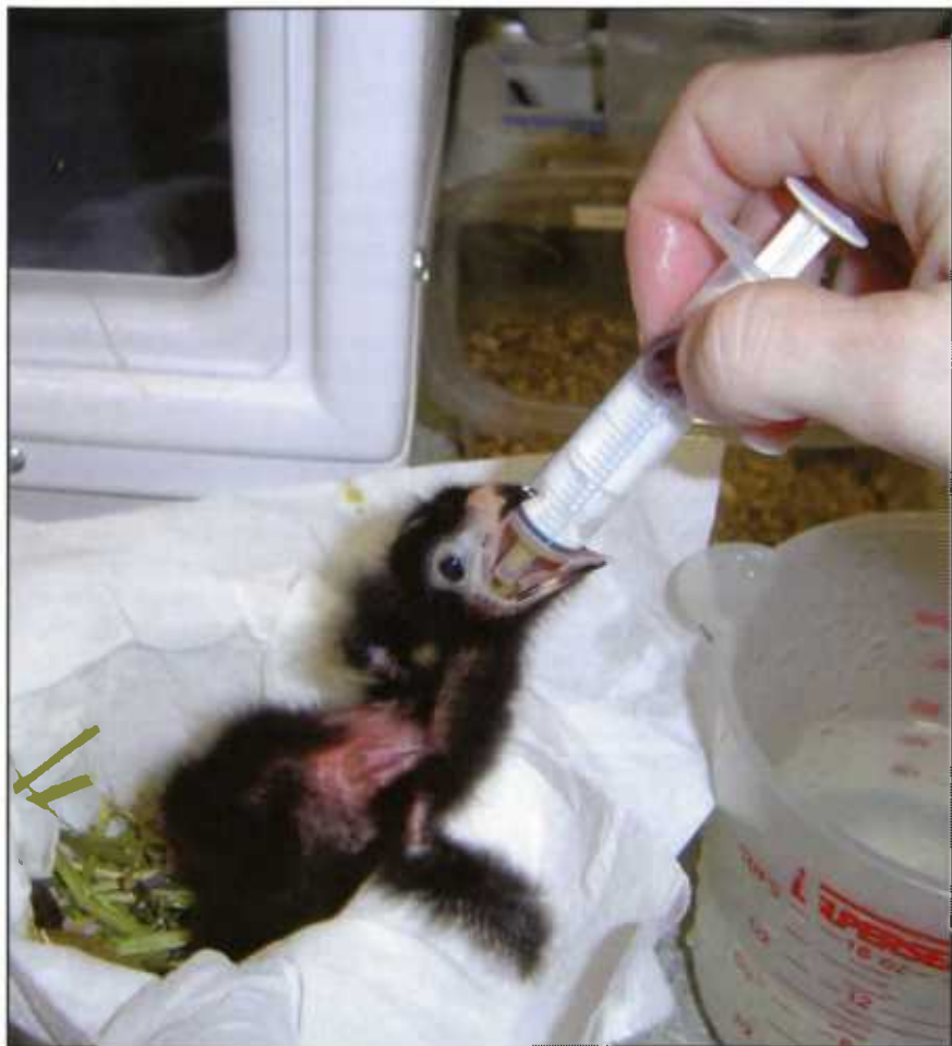
Turaco chick being fed! Note straw in bottom of cup to prevent splayed legs.

My problem though is that handraising while working full time out of the house is a big chore. Being able to be mobile while successfully handfeeding any chick is tricky. For two weeks or so, the handfeeder has to be on the bird's schedule and is usually tied to the house. Luckily, turacos take handfeeding on the run in stride, and having now figured out a successful technique, I have the freedom to leave the house and still raise healthy turacos.