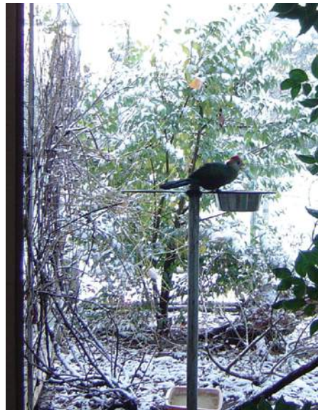
Red Crest Turacos in a flight with an indoor area they can use at will.