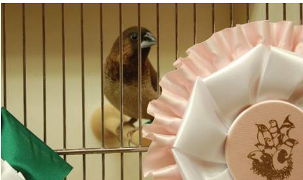
Brother peaks out from behind his ribbons at the 2009 National Cage Bird Show in Tulsa.