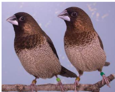
Sister (left) and Brother (right) after winning Best in Show as a pair at the Texas Bird Breeders Show in 2012.