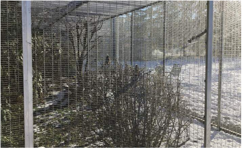
White Back Mousebirds sunning themselves on a cold, 20°F morning