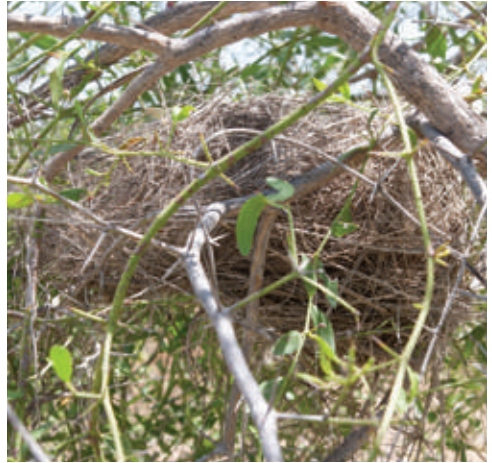
Owl finch nest in the wild.