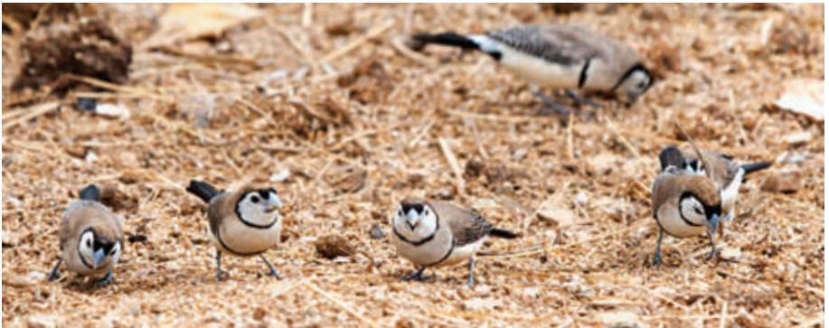
Wild Owl Finches in Australia.