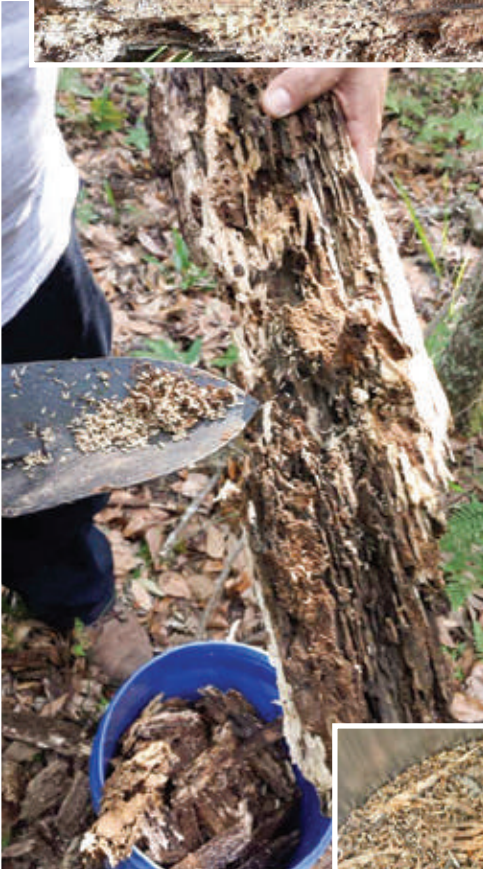
Gathering termites in the local forest. Termites can be found in dead tree trunks or rotting wood.