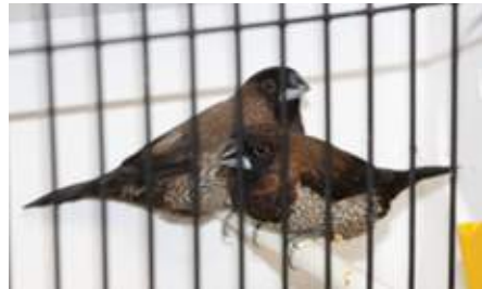
8 th Place: Pair Black/Brown Societies Hiram (Ken) Rampersaud