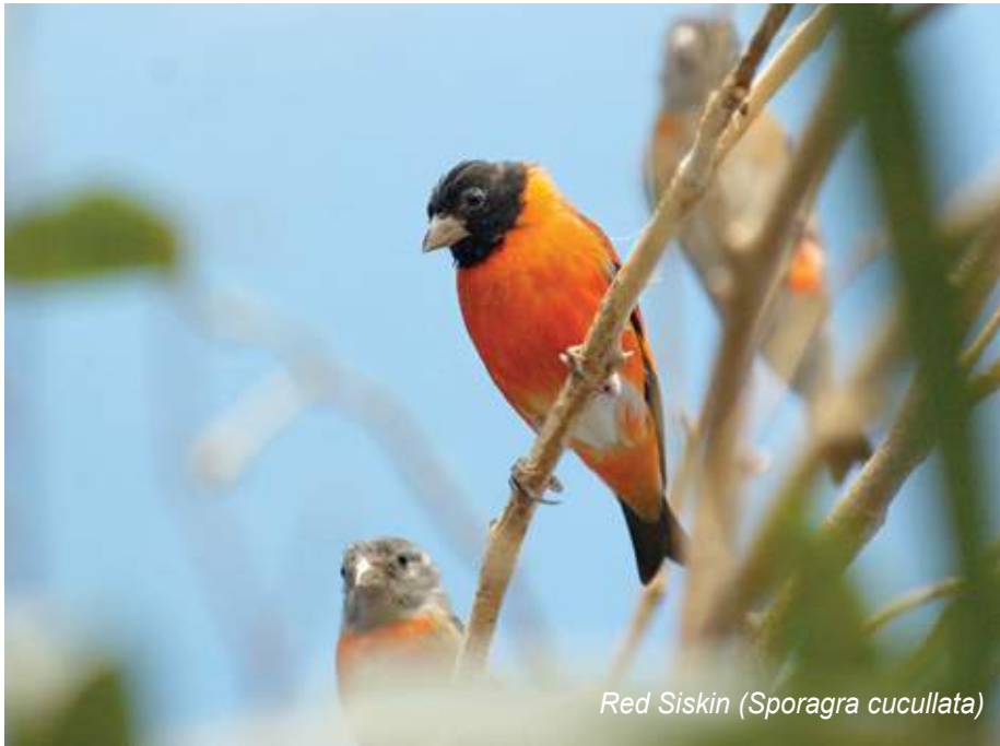
Red Siskin (Sporagra cucullata)

The Red Siskin ( Sporagra cucullata ) is an iconic bird of northern South America and the Caribbean that is internationally endangered mainly due to intensive wildlife trafficking for the pet trade. In Venezuela, Red Siskins have been trapped for centuries but the most severe decline occurred in the early 20th century when it became popular to deliberately hybridize this species with domestic canaries to produce a “red factor” variety of canary. The bird was severely over-harvested, resulting in an estimated reduction of over 90% across this range, including complete removal from most of the eastern portion and the neighboring islands of Trinidad and Tobago.