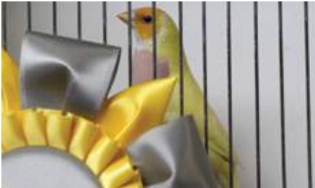
5 th Place: Yellow Purple Breast Gouldian Laurie & Demetrious Erwin