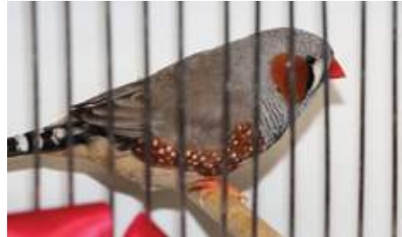
10 th Place: Normal Zebra Cock Carlos Mendez