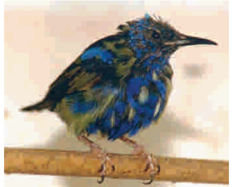
Young male I bred just coming into colour.

Unique Characteristics: They are very active birds and the males are frequently singing, yet not at all noisy. They are not suitable for the newcomer to bird keeping. I would, however, recommend them to someone that wants to start with nectar feeders, after having experience with other softbills.