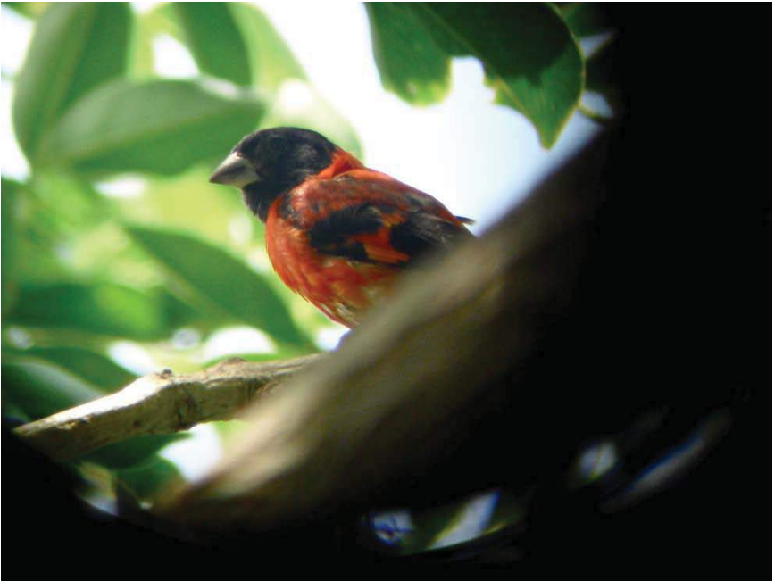
WILD RED SISKIN IN VENEZUELA

Results show substantial differentiation between Red Siskins in Guyana and Venezuela, which suggests they should be managed as distinct conservation units that should not be used to supplement each other. Current research is focused on refining estimates of genetic diversity and developing genomic markers (ultra-conserved elements, microsatellites, single nucleotide polymorphisms) for management of an ex situ captive breeding program through the use of next-generation DNA sequencing (NGS) technologies.