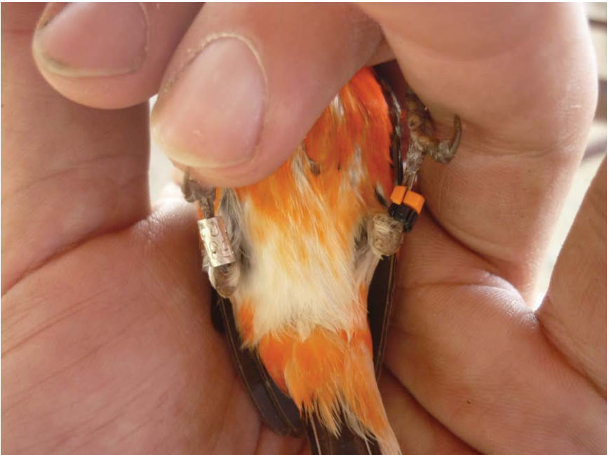
RED SISKIN MARKED WITH LEG BANDS FOR FUTURE IDENTIFICATION

This commitment to education also extends to project partners in Venezuela and the United States. Bararida has an innovative education campaign with diverse elements including visits to schools, and on-site programs that aim to create “green citizens” who are knowledgeable advocates on conservation issues. Smithsonian partners are working to produce a television program about the Red Siskin Recovery Project, and web-based education resources are planned for the future. Project members have also been providing field and laboratory research training and other significant professional development opportunities to promising young conservationists from South America.