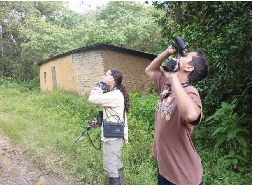
FIELD RESEARCHERS SEARCHING FOR RED SISKINS AND RECORDING VOCALIZATION

A promising site for the breeding program is Parque Zoológico y Botánico Bararida, located in the city of Barquisimeto in Lara state, Venezuela. The Red Siskin is the state bird in Lara and Bararida has a government mandate to conserve the species. Bararida also has a history of success in ex situ breeding and a vibrant conservation education program built around the Red Siskin. Currently, they have two pairs of red siskins that were confiscated from trappers; however, existing facilities are inadequate to support a full scale ex-situ conservation program.