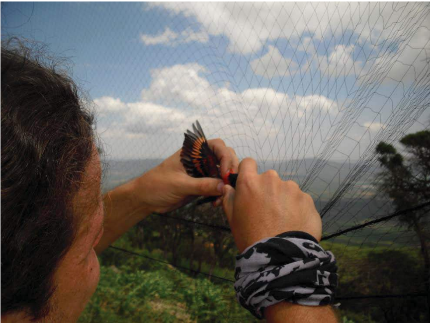
CAPTURED RED SISKIN BEING RELEASED FROM MIST NET

In addition to making progress on developing a captive breeding program, the Red Siskin Recovery Project has also been exploring reintroduction strategies. One possibility is based on the Smithsonian Migratory Bird Center's "Bird Friendly" coffee certification program. This program marries economic development with conservation by providing market incentives for farmers to adopt agricultural practices that improve habitat and support biodiversity.