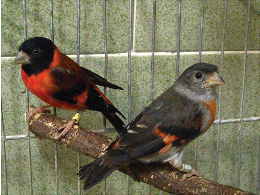
RED SISKIN PAIR CONFISCATED BY AUTHORITIES HOUSED AT PARQUE ZOOLOGICO Y BOTANICO BARARIDA

NOTE: unless otherwise indicated, field work photos were taken by GONZALO MEDINA, JHONATHAN MIRANDA, ALEJANDRO MORENO AND SAMUEL TORO.