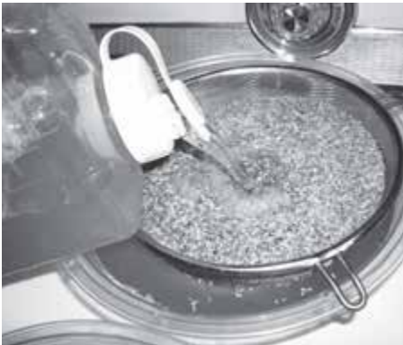
Pour enough soaking solution over the seed to completely cover it. Mix frequently.