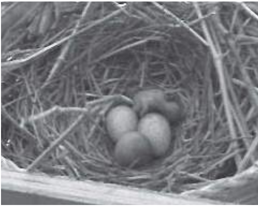
Day 1 and eggs of yellow breasted cissas

We have bred Long-tailed Cissas every year since 1997 and Yellow-breasted Cissas since 1999.