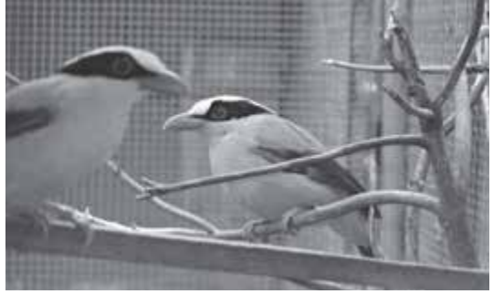
Long tailed cissa/green magpie

They can be found in subtropical and temperate foothill evergreen forests between 300m ascending to as high as 3,000m in the summer. They range from Eastern and S Eastern Asia along the Himalayas, Foothills north and east through most of eastern China.