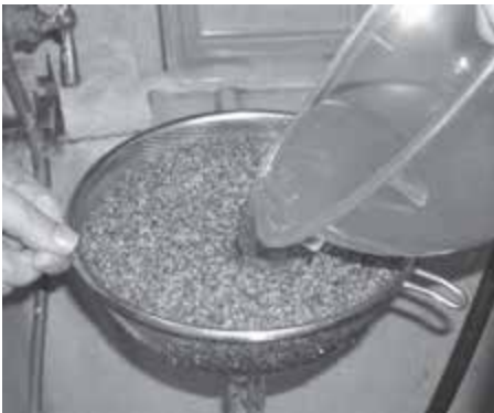
Time to drain - I use the solution to rinse the bowl and pour any loose seeds back into the strainers.

The thing I do that is VERY different from Mike's method is that I soak the seed on top of the clothes dryer while it is running. The combination of HOT water and HOT dryer help to soften the hulls of the seed and chit it faster. Because most seed we purchase from seed suppliers is NOT "Grower's Seed" like the Birds R Us seed, it takes a bit of heat to get the hulls to crack. Using the hot water gives it a boost. Soaking while on top of the dryer, the water stays hot longer and softens the hulls quicker. My dryer takes approximately 30 minutes per load, so if I run 3 loads (and even with only 2 kids left at home, I can easily do 3 loads per day!), I know I've soaked the seed for a minimum of 15 hours.