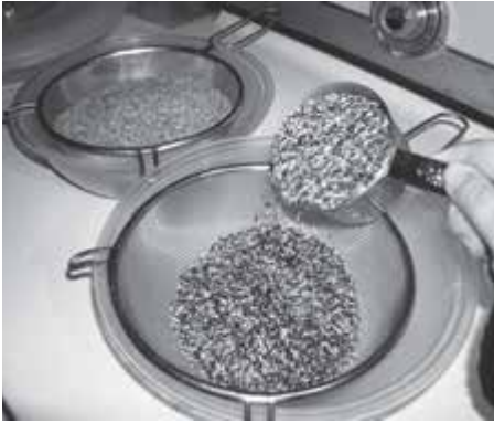
Strainers and Bowls - measuring seed 1:2