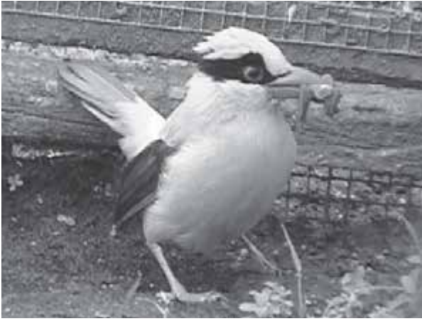
Short tailed Cissa

Fruit Dove breeder and expert, informed me of seeing recently caught birds that were entirely blue at bird markets in Singapore. They do seem to spend most of their time in the aviary shelter or in the shade of the plants in the aviary.