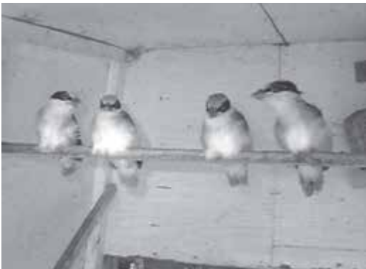
Baby Yellow breasted just off nest

We use 'rushes' (appendix C) as nesting materials. We have had hens that built a neat nest in 1 day. We have found that if not enough material is provided at one time for the hen to complete her nest she will build and tear down her nest.