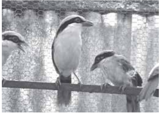
(right) Baby Yellow breasted Cissas. (center, left) Parents

her out of rushes and mowed grass at the bottom of it. The birds will sometimes immediately lay in such a nest. But most of the time they will tear it apart until such time as they are ready to lay. Therefore it is a continual job of us rebuilding their nest until eggs are laid. Once eggs are laid they generally don't tear the nests apart. We have done this with Cissas, Blue Magpies, Treepies, and Jays with good results.