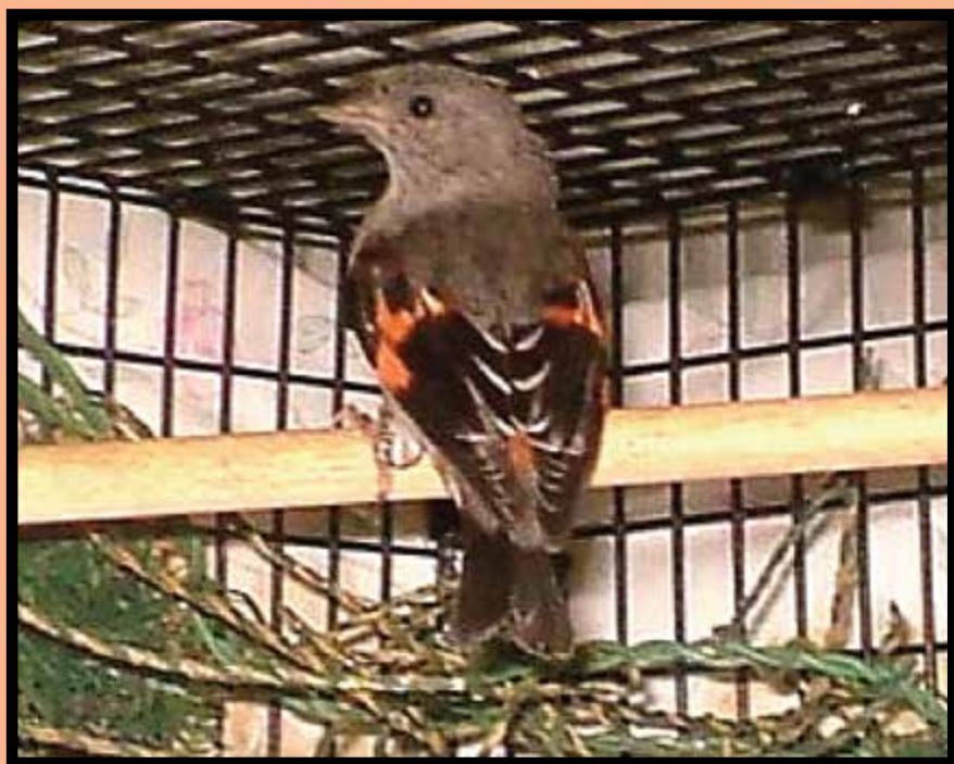
RED SISKIN FINCH Carduelis cucullata