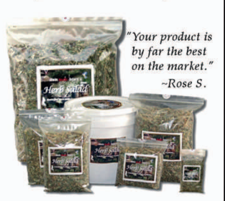
"My birds love it!" ~William W.

"We consider Herb Salad essential to our feeding program." Twin Beaks Aviary began using Herb Salad in 1989. Increased breeding success, minimized use of meds and lower incidences of illness is a testament to its effectiveness. "We promise freshness and quality in all of our products and back it with a 100% Satisfaction Guarantee."