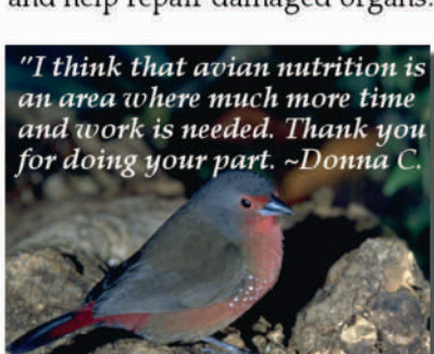
The ORIGINAL and ONLY Herb Salad™

Unlike medication, Herb Salad works by prevention. It provides your birds with the means to combat deficiencies before they become a danger to their health. Invaluable to the bird keeper is his bird's ability to instinctively self-medicate before displaying the changed behavior that first alerts us to a health concern. Beneficial to both healthy and ailing birds, Herb Salad can strengthen the immune system and help repair damaged organs.