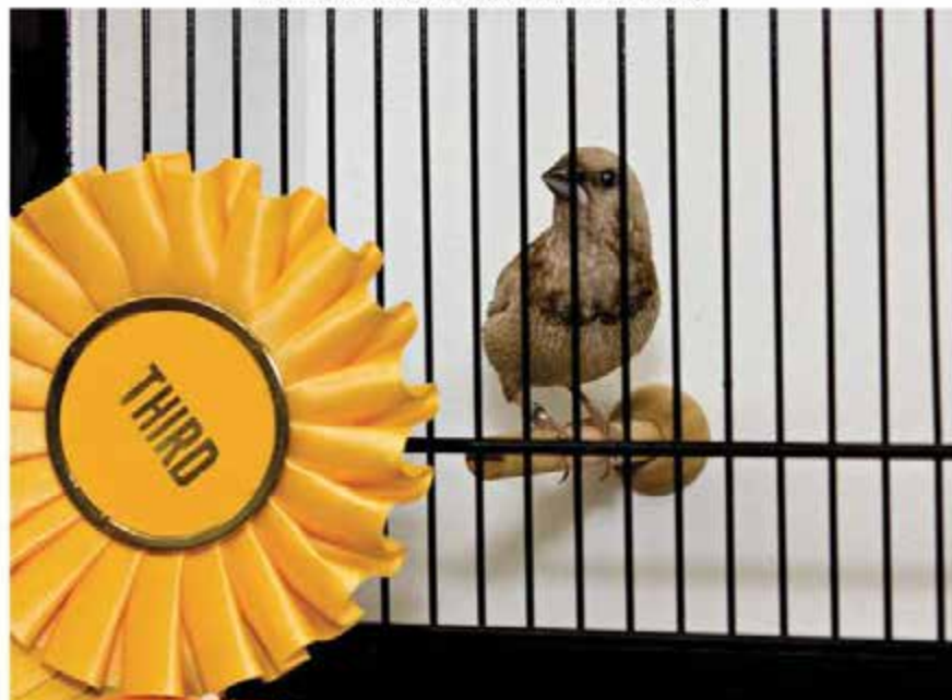
KJ Brown's Division 4 Third Place Pearl Society