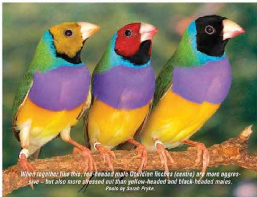
When together like this, red-headed male Gouldian finches (centre) are more aggressive – but also more stressed out than yellow-headed and black-headed males.