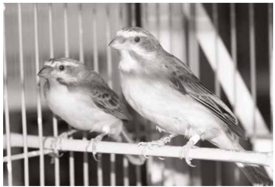
Green Singer Pair (Male left)

many fertile eggs but the male broke all but 2 of them. After these 2 chicks fledged, the male stopped feeding one of them after about 20 days. They successfully raised only one chick. I decided that this male needed to be in the larger sun porch flight (not a giant cage) for subsequent breeding seasons and the female needed a closed nest basket.