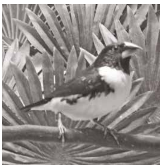
Magpie Mannikin

Like most other members of this genus, Magpie Mannikins are easy to maintain in good health, but difficult to breed. A basic diet for these birds consists of a finch seed mix with a good percentage, about 20%, in the form of the oily seeds (flax, niger, rape, hemp, sunflower, safflower, poppy, and others. Most of the finch seed mixes on the market are far too low in their content of these oily seeds, and I frequently see birds in aviculture that are not getting enough fats and oils in their diet. The fad for low-fat and fat-free diets has totally neglected the fact that all of the fat soluble vitamins are dissolved in the fats and oils that occur in In avian diets, without oily seeds and the fat content of insects, the food content of vitamins A, D, E, K, and the essential fatty acids, often called vitamin F, are far too low. Adding a vitamin-mineral supplement to the feeding will help to supply the missing fat soluble vitamins, but no supplement that I have seen includes the essential fatty acids, vitamin F. I add a