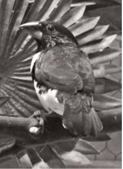
Magpie Mannikin

In order to succeed in raising your first generation of this species, you probably will have to resort to the use of foster parents to raise your first clutches of young ones. Society Finches are the best foster parents for the Magpie Mannikins, since the two species are so closely related. Though you are more likely to experience success if you transfer a clutch of mannikin eggs to